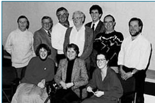
Other former hosts of the Fisheries Broadcast

Here are some of the people who have brought the Fisheries Broadcast to Newfoundland and Labrador since 1951.